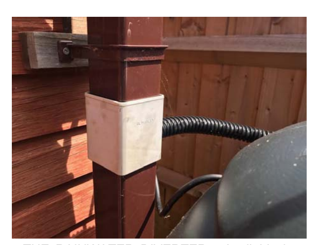
THE RAINWATER DIVERTER - Available in black and brown, quite how I managed to buy a grey one beats me - but at least it shows up on the photos

The water butt pump is located in Butt 1. Water flows from the diverter into Butt 2. There is an interconnect pipe between the two butts about 5" above the bottom of the butt. This forms a sediment trap in both butts into which debris can accumulate rather than enter the pump. The position of the interconnect pipe ensures that the water level is always the same in both butts.